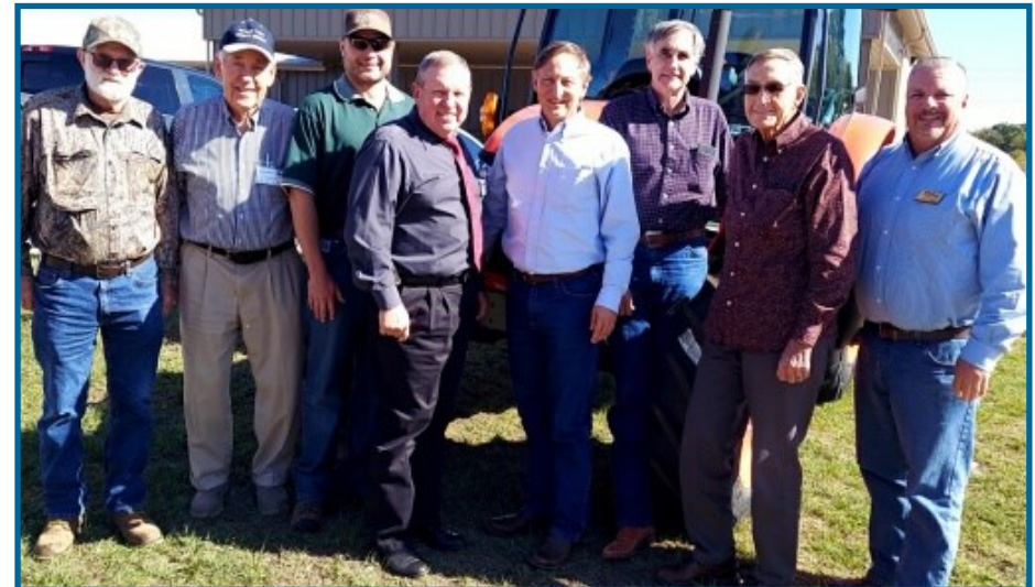
Sabine-Neches RC&D Board of Directors